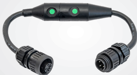
Break Away Connector