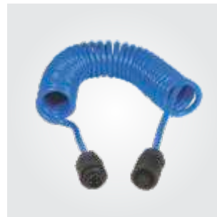
Cen-Stat cable supplied with male and female In-Line Quick-Connects.

The spiral cable provides effective retractability when the clamp is not in use, ensuring the cable is neatly stowed and safely out of the way.