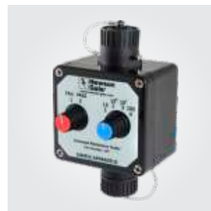
Universal Resistance Tester Product Code: URT.